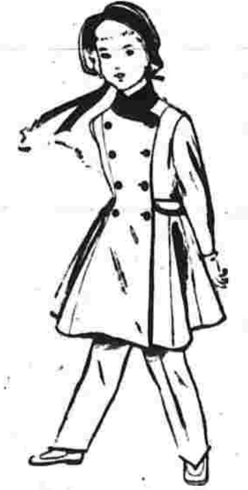
Sizes 4 to 6x, 7 to 14

Virgin wool coverts and brodcloths, wool interlined by GASTWIRTH, COAT- CRAFT, JUBILEE or YORK- STER, all with extra hems for an extra year's wear. Comes in wine, toast, green, plaids and tweeds.